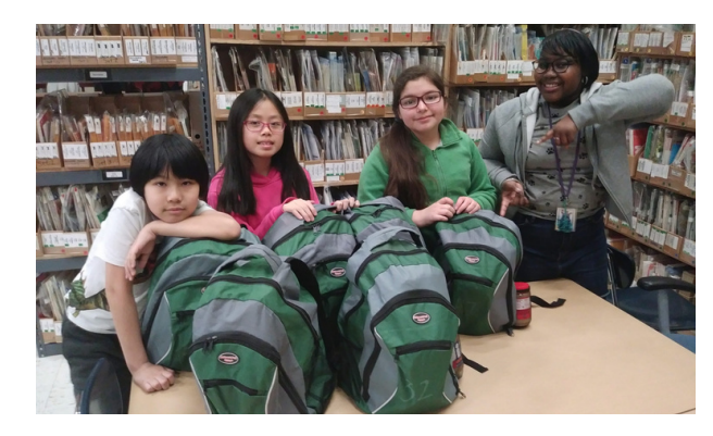
This school year, Bob's Red Mill helped provide weekend food for children in Portland, Oregon.